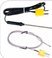
Temperature measurement probe (K-type, bayonet) WASONTEMP probe (K-type, metal) WASONTEMK2