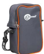
M13 carrying case WAFUTM13