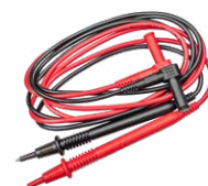
Test lead with probe for CMM/CMP (set) WAPRZCMP1