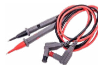
Set of test leads CAT IV, M WAPRZCMM2